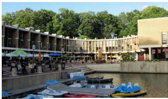
Lake Anne Plaza in Reston, VA