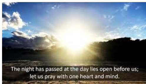
The night has passed and the day lies open before us; let us pray with one heart and mind.

Jesus prayed, in John 17:20–21, “I am not asking on behalf of them alone, but also on behalf of those who will believe in Me through their message, that all of them may be one, as You, Father, are in Me, and I am in You. May they also be in Us, so that the world may believe that You sent Me.” We are not expected to all think exactly