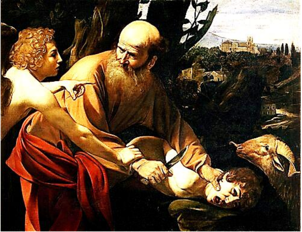
The binding of Isaac by Caravaggio